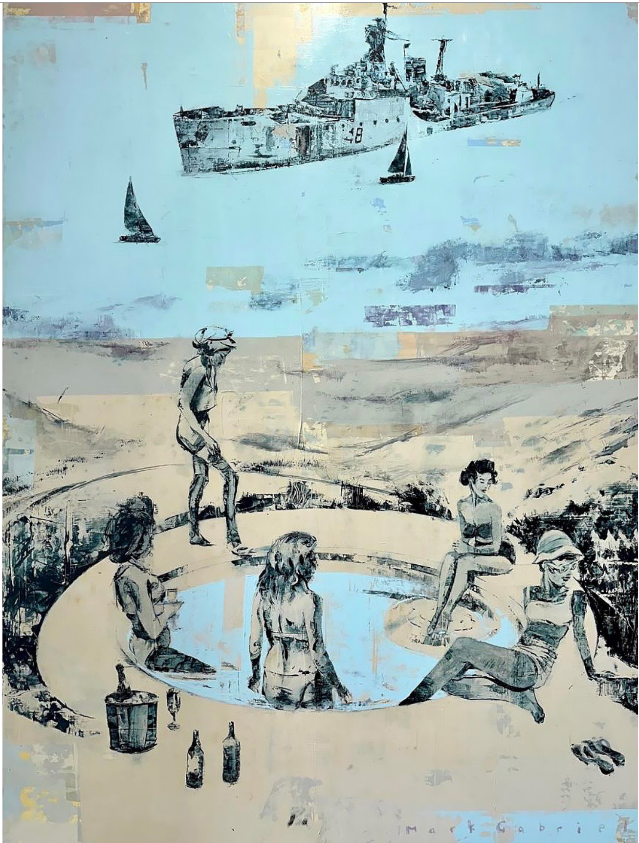
Oblivion Song 48" x 36" Acrylic, mixed media, ink on wood panel 7200 / 135,000