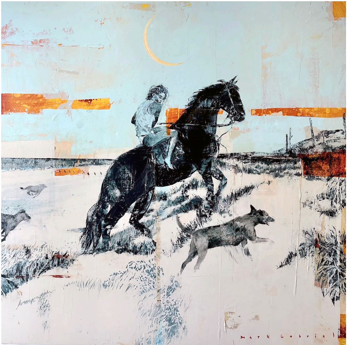
Dune Rider 48" x 48" Acrylic, mixed media, ink on wood panel 8500 / 160,000