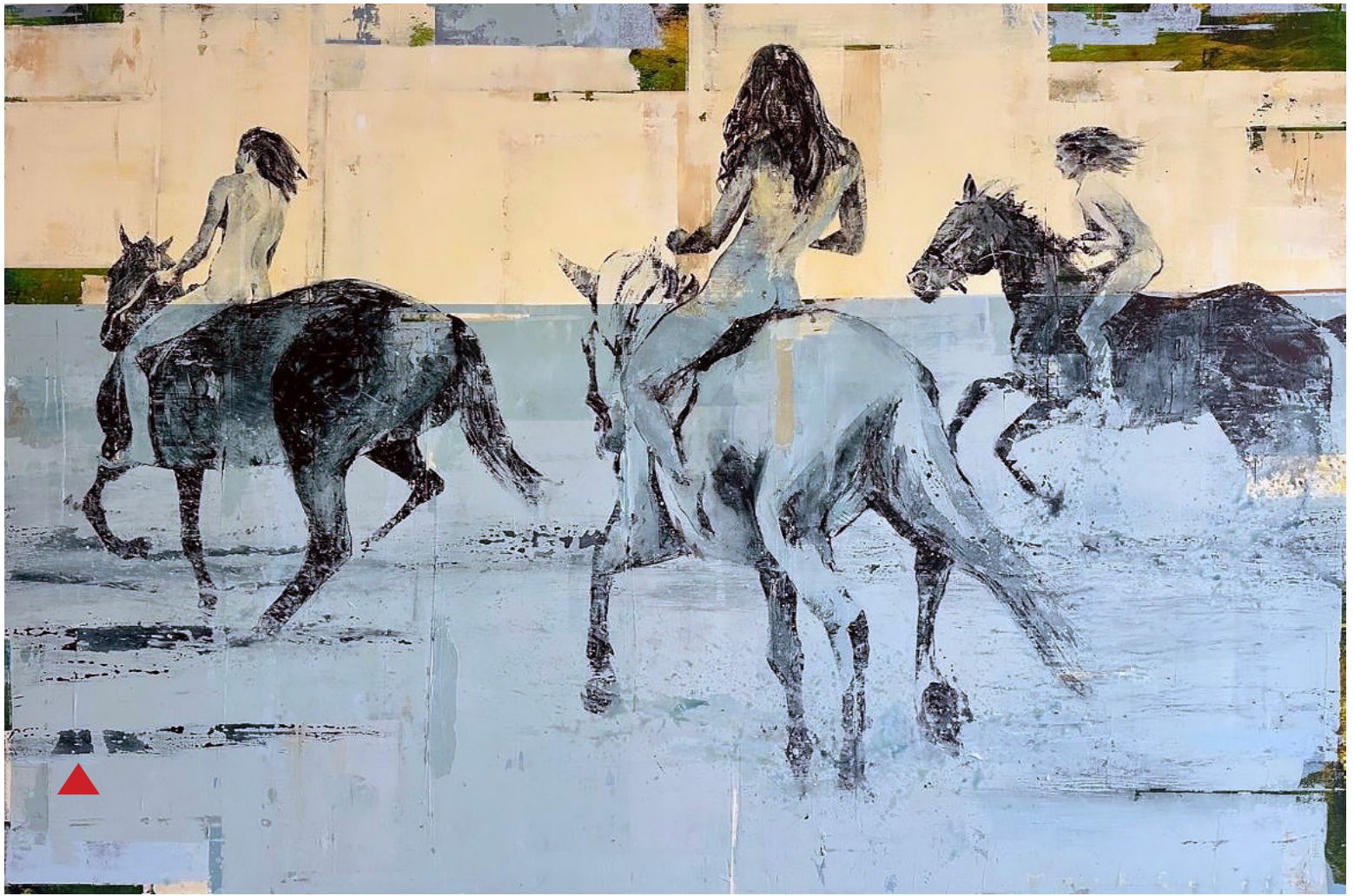
Sirens in the Surf 48" x 72" Acrylic, mixed media, ink on wood panel SOLD