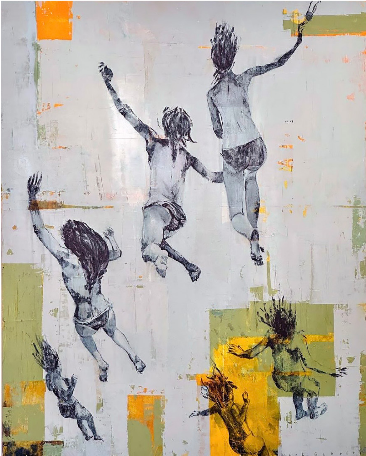
Sisters in the Aether