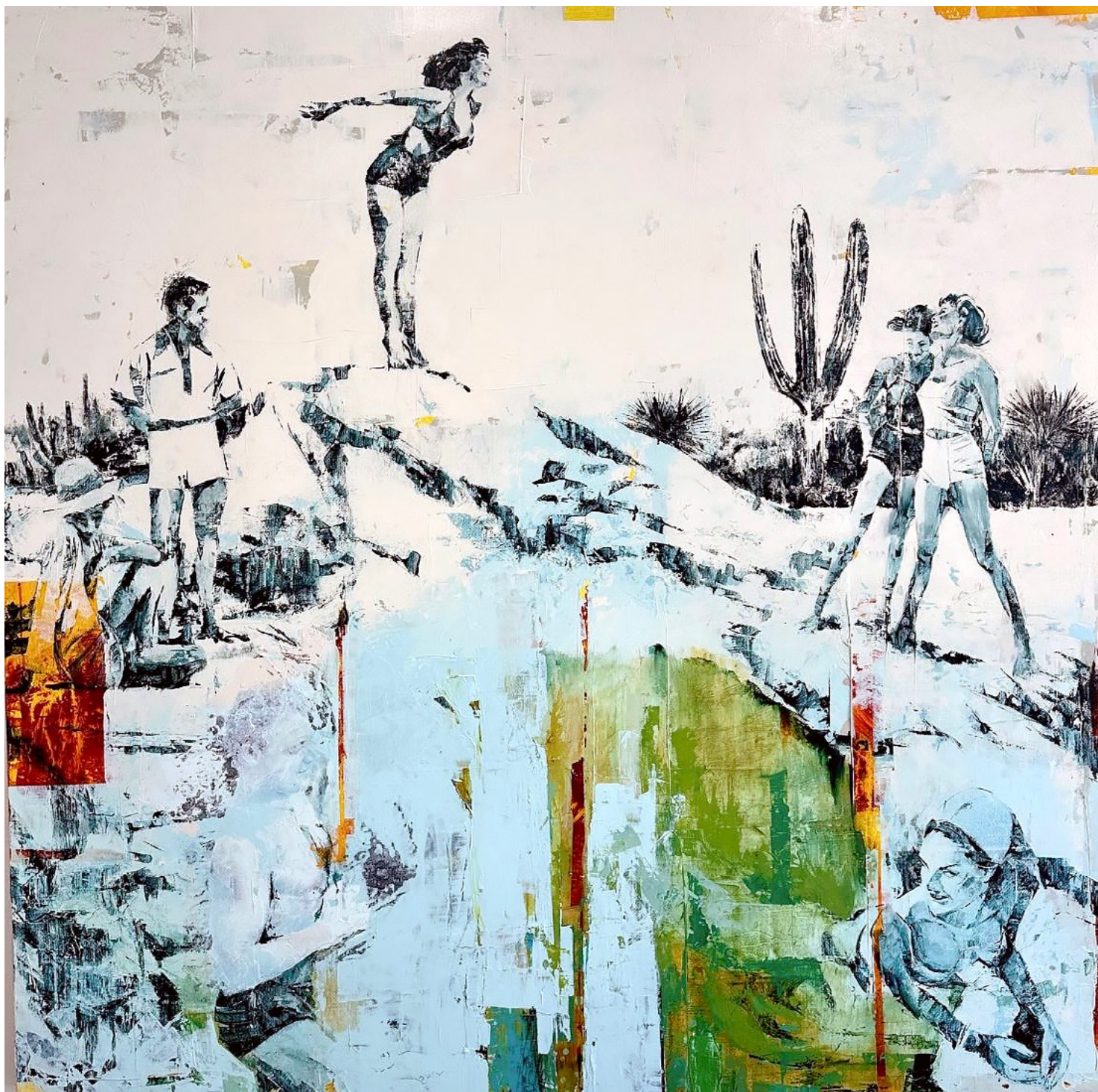
At the Grotto 48" x 48" Acrylic, mixed media, ink on wood panel